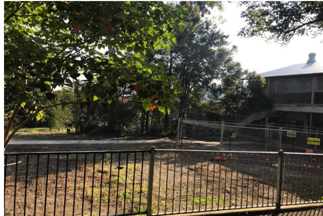
Demountable classrooms were removed during the school holidays