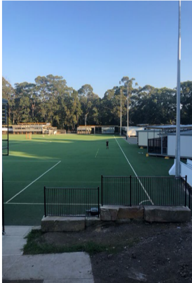
Temporary demountable classrooms for Year 1 in BC