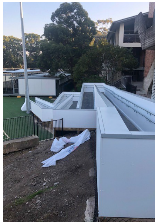
Accessible ramp in the north-west corner of the oval. The temporary fencing has been removed from around the oval.